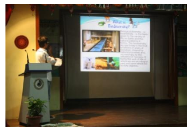
Power Point presentation

On the 4 th day, students expressed their views through power point presentation on the assigned topic “ Biodiversity loss and Climate Change ”. The students wrote slogans on Wildlife in slogan competition. The students also performed “ Nukkad Natak ” during the Wildlife programmes. The competitions were followed by Wildlife Conservation Rakhis as well as interaction between the experts and students. The wildlife photography exhibition was the centre of attraction for all. A lecture on “ Enchanting