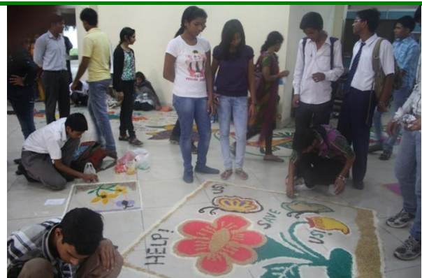
A view of Rangoli making competition