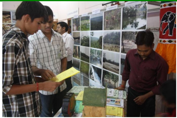
A view of exhibition