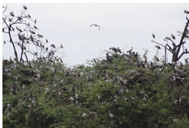
A view of Bird Sanctuary