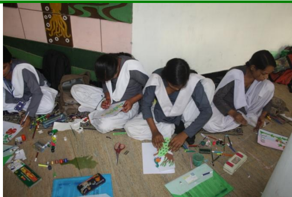
Students making greetings cards and collages