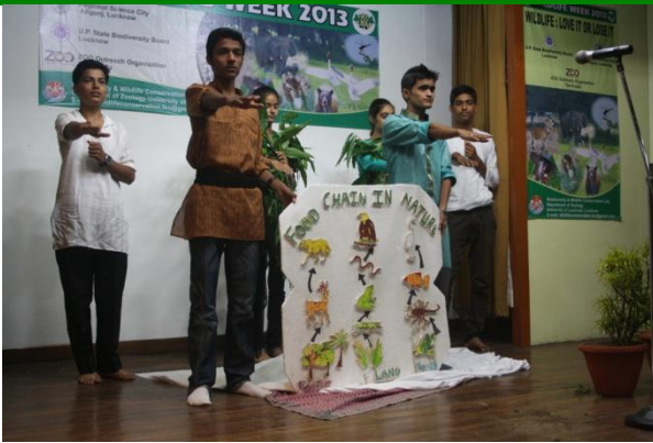
Students taking vow to conserve wildlife