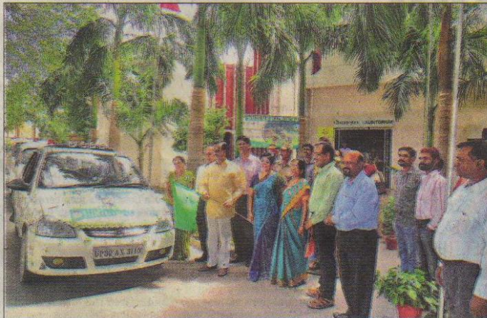
■ Mayor Dinesh Sharma flags off the wildlife awareness car on Tuesday from Kanha Upwan. The car will move across Lucknow throughout the week and distribute awareness material on protecting the fauna.

Elucidating on steps being taken to support state's ecology, he said, "The forest department had set a target of planting 4.4 crore saplings this year. Going a step ahead, we managed to plant 5.5 crore sapling by the end of the Van Mahotsava."