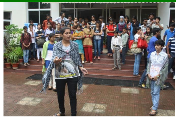
Students performing Nukkad Natak