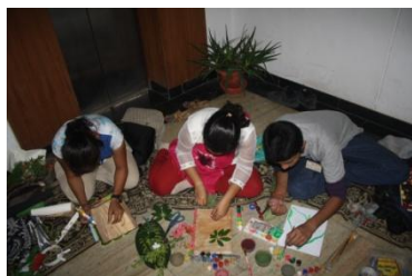
Painting, collage and greeting card making competition

On the 3 rd day, Painting, Collage and Greeting card making competitions were held. More than 200 students took part from 25 different schools and colleges of the Lucknow. The topic of painting was “ Human and Animal Conflicts ”. Greeting card making competition was on the topic of “ Wild Flora ”. Collages were created on “ Freshwater Biodiversity ”.