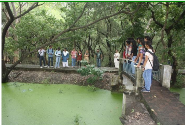
A visit to Nawabganj Bird Sanctuary, Unnao