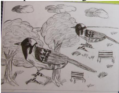
3<sup>rd</sup> prize Satvik Rastogi