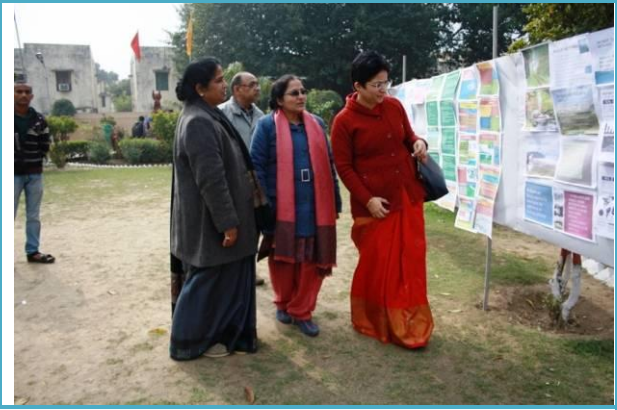
Poster judgement by the experts at Regional Science City, Aliganj, Lucknow