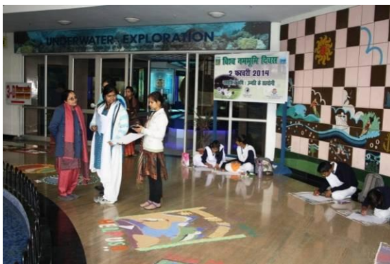
Judgement of Rangoli by the experts