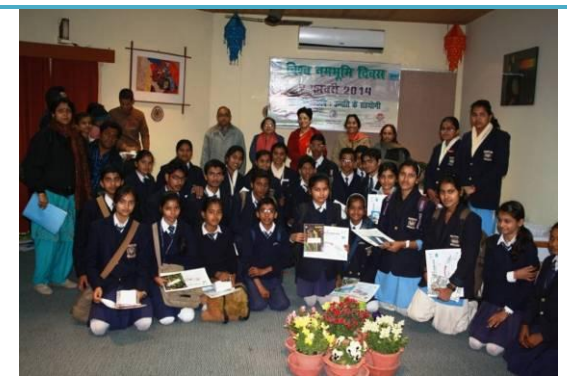
Photograph of the winners of the events