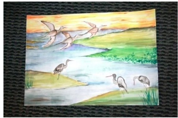
Paintings made by students