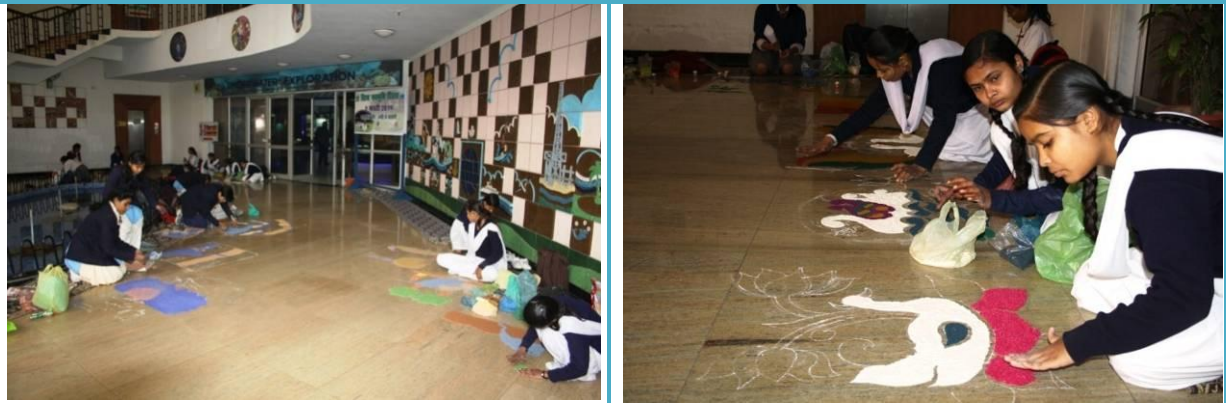
Students taking part in Rangoli competition