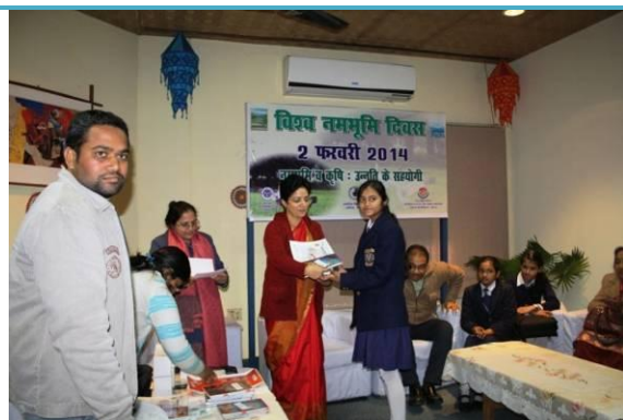
Prize distribution to winners