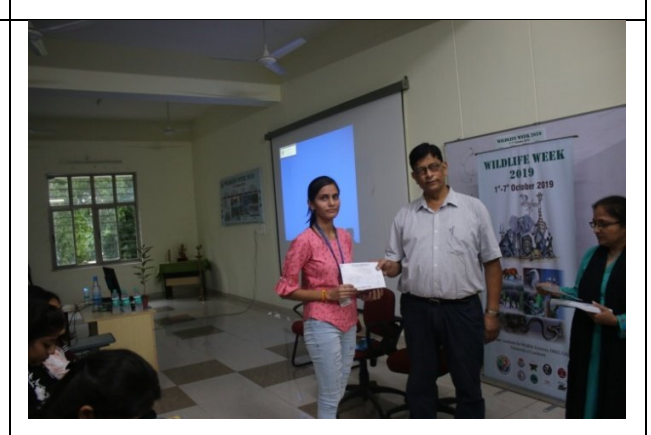
Felicitation of Participants