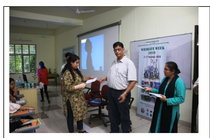
Interaction with Participants