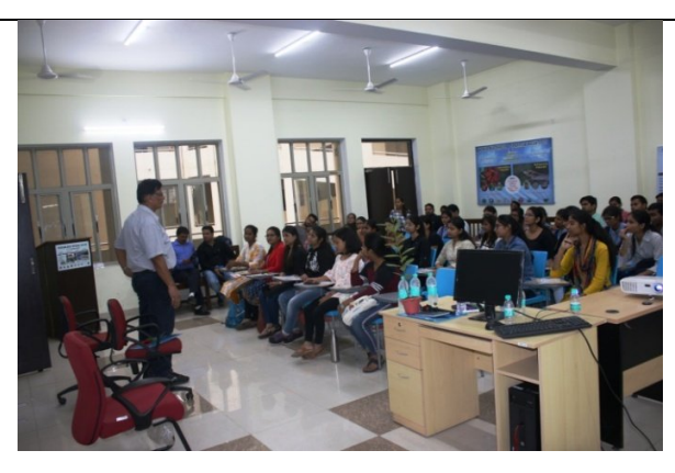
Interaction with participants