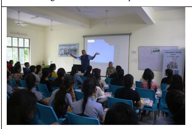
Lecture series by experts