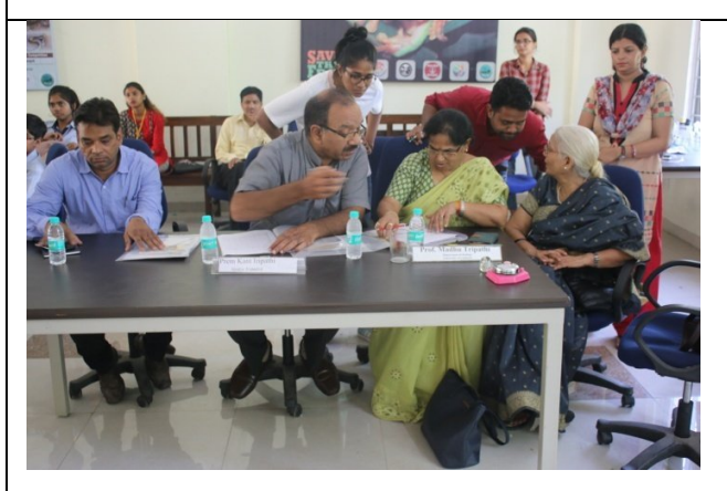
Judges of Different Competitions