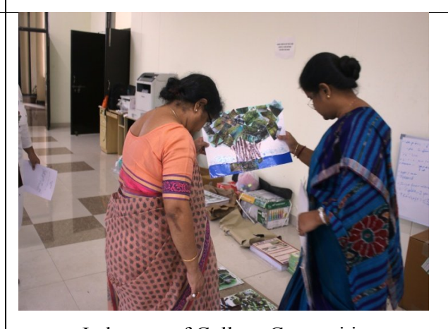
Judgment of Collage Competition