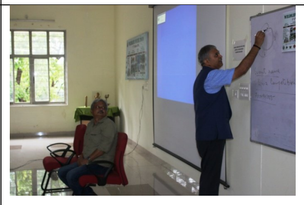
Lecture series by different experts