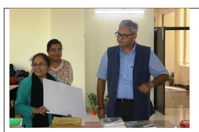
Display of Awareness Material