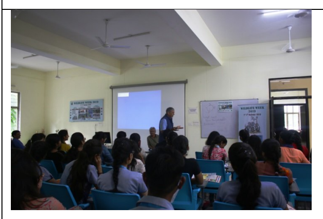
Interaction with Participants