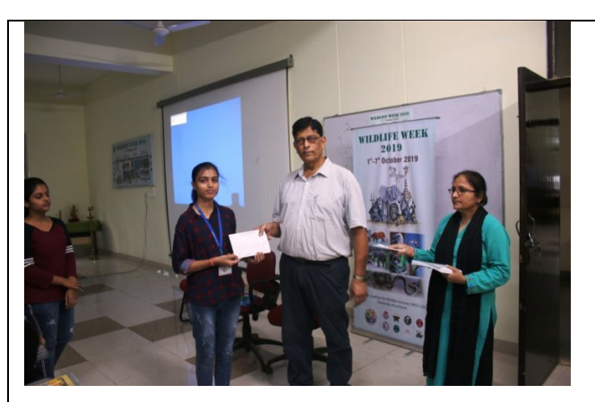
Felicitation of Participants