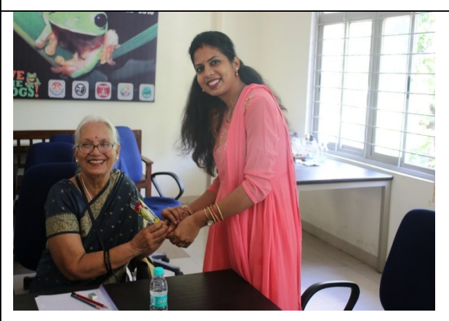
Welcome of Honorable Judge