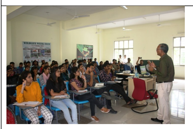
Interaction with participants