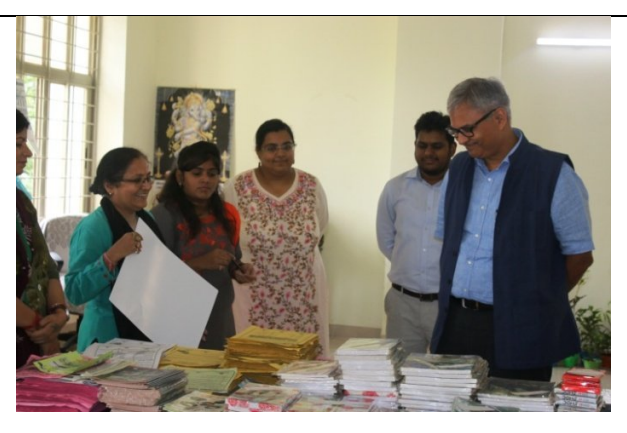
Display of Awareness material