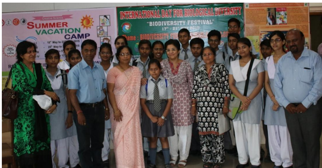
Participants with teachers and organizing team