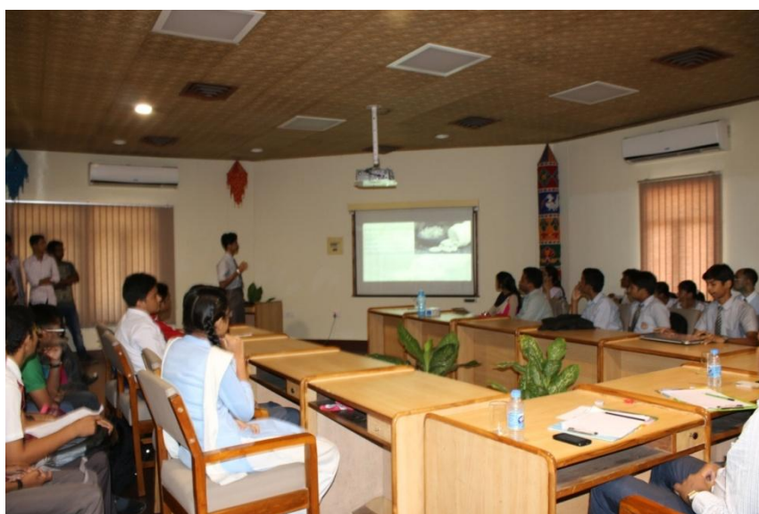
Students are taking parts in PowerPoint Presentation