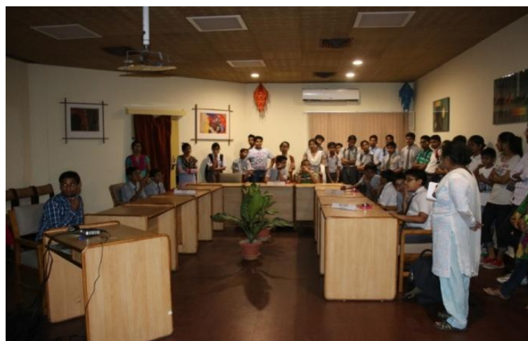
Students taking part in the quiz competition