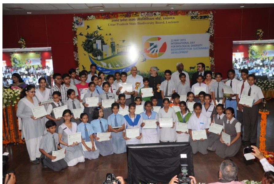
Group of Prize Winners