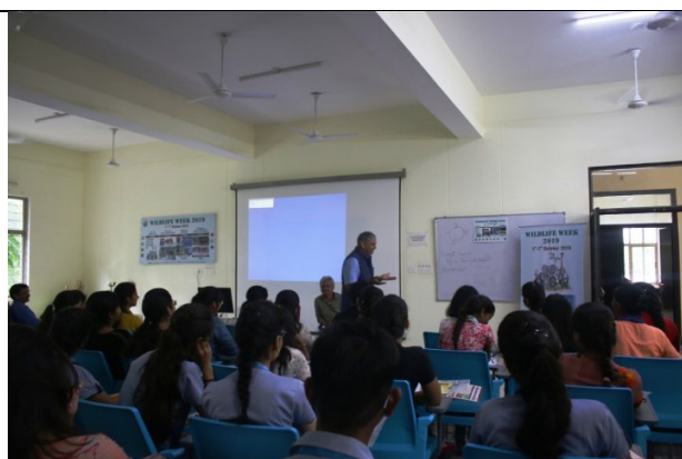
Interaction with Participants