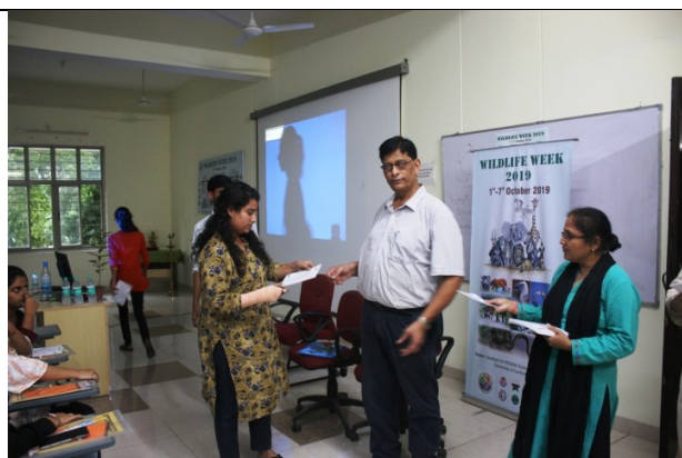
Interaction with Participants