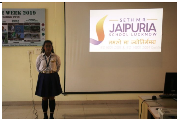
Participant of Debate Competition