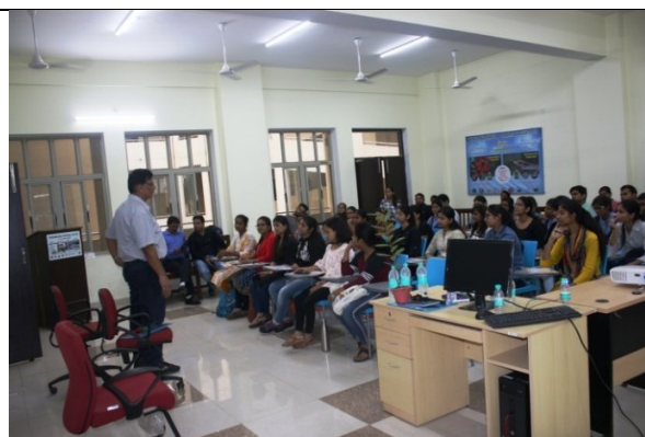
Interaction with participants