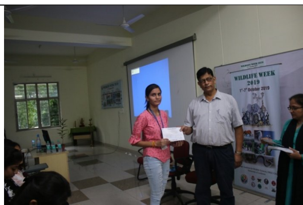
Felicitatation of Participants