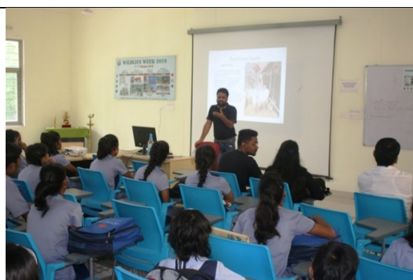
Interaction with participants