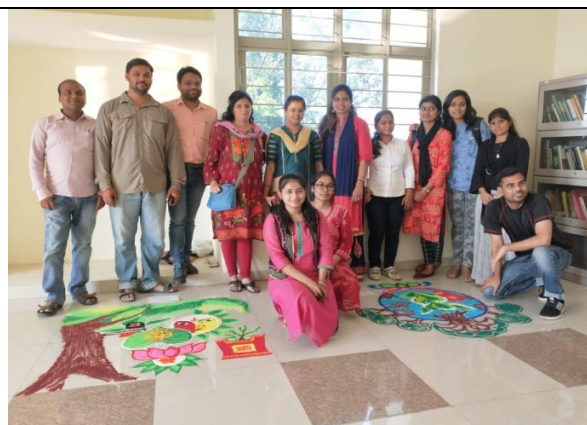
Group photo with Volunteers and Participants of Rangoli