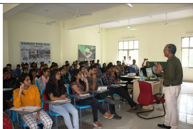
Interaction with participants