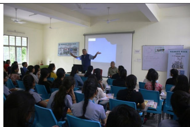
Lecture series by experts