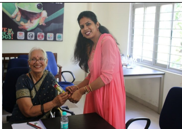
Welcome of Honorable Judge