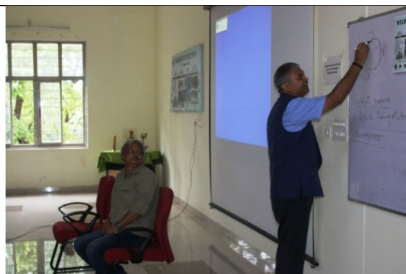
Lecture series by different experts