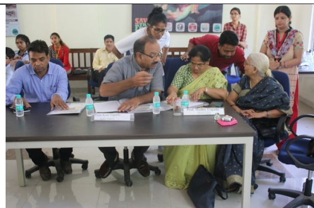
Judges of Different Competitions