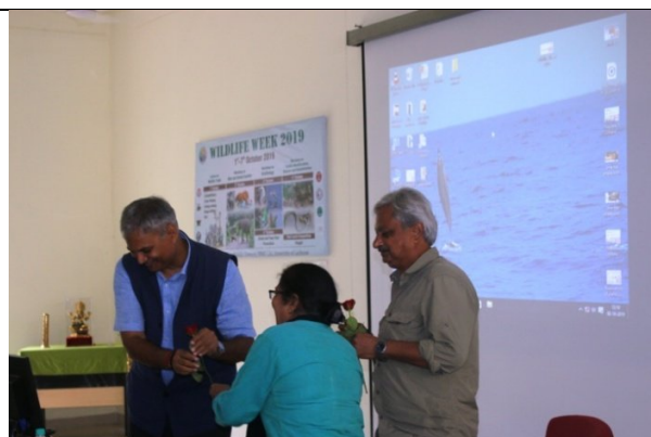
Welcome of Speakers