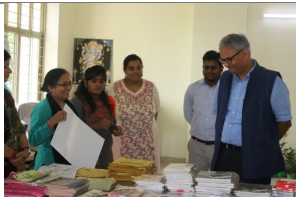
Display of Awareness material