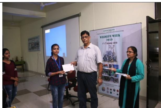
Felicitation of Participants