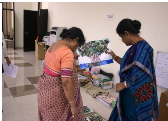
Judgment of Collage Competition