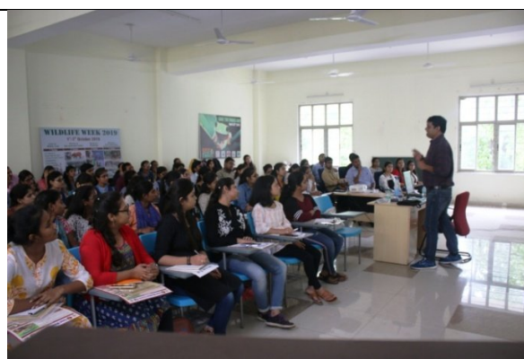
Lecture series by experts