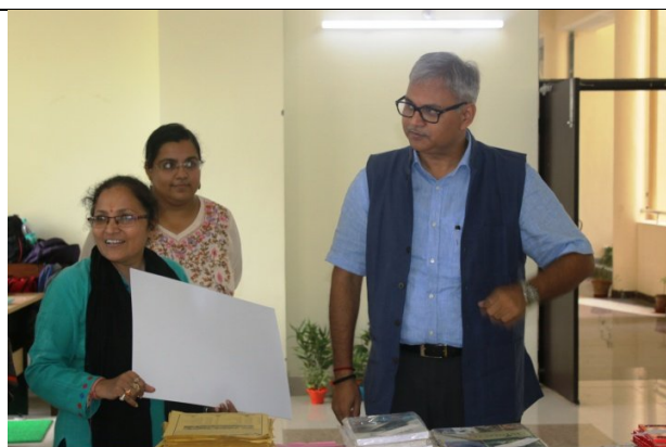
Display of Awareness Material