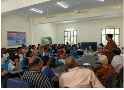
Discussion with school children on vultures