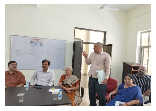
Discussion by Professors.