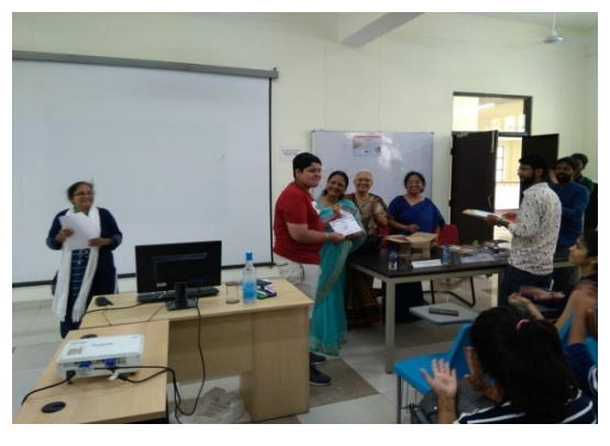
Certificate distribution to participants