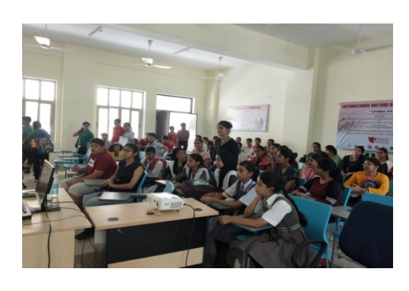
Attending the lecture attentively by children