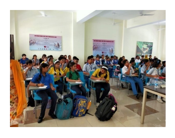
Participants from different schools