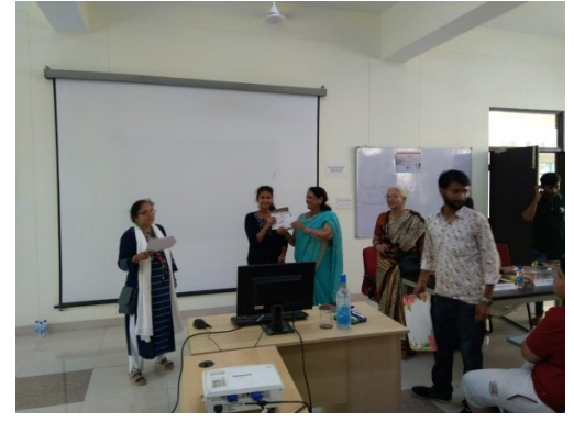
Certificate Distribution to participants