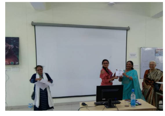
Distribution of Certificates