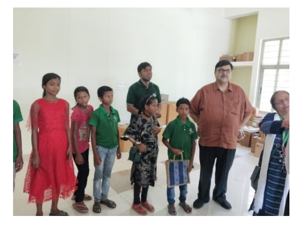
Participants from Robin hood Army,