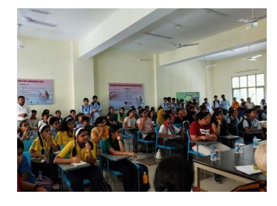
Students from different schools attending the lecture.