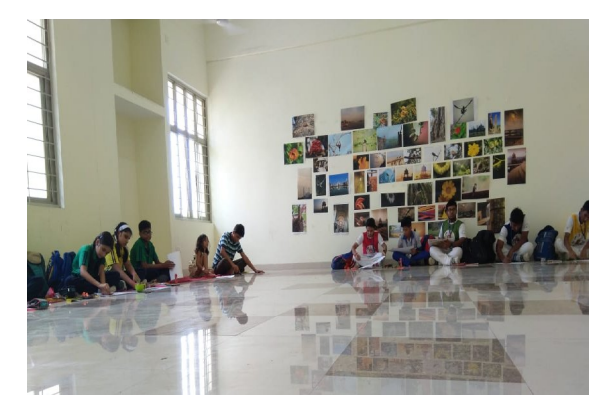
Poster competition at ONGC